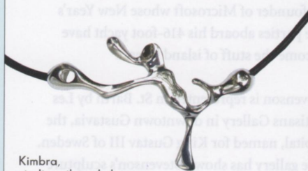
Kimbra, sterling silver choker